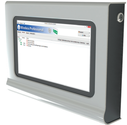
WirelessControl PC wall housing WLWGTOUCH