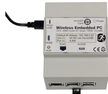
Wireless Embedded PC